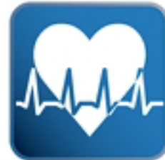
Health and Social Support